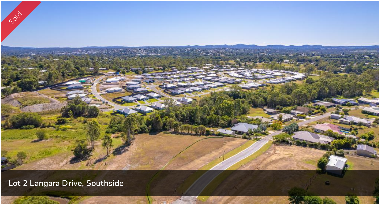
Lot 2 Langara Drive, Southside