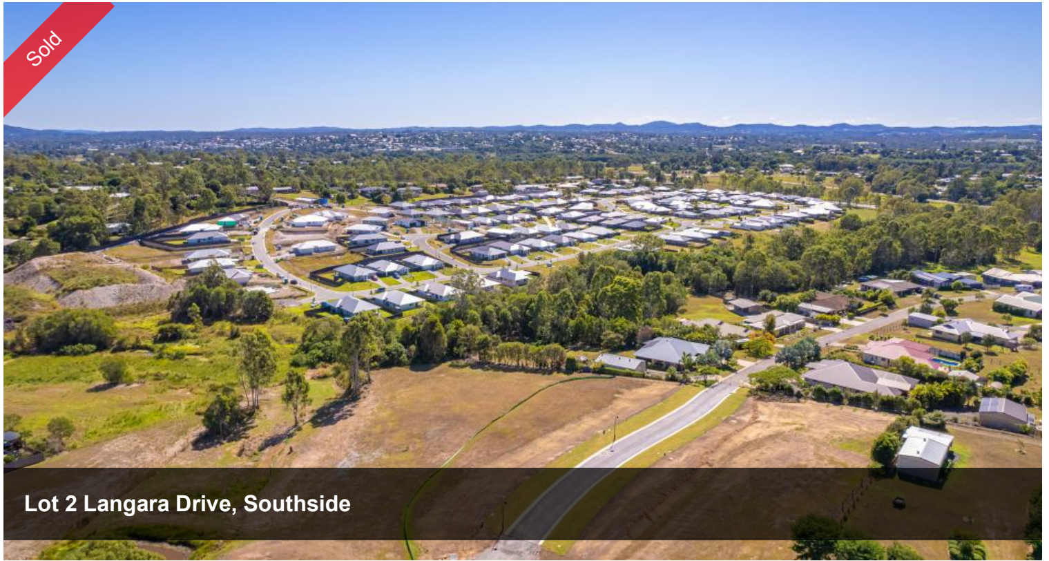
Lot 2 Langara Drive, Southside