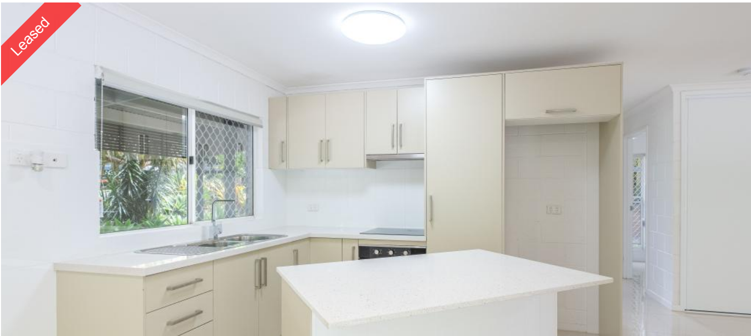
Unit 1, 3 Kidgell St, Gympie