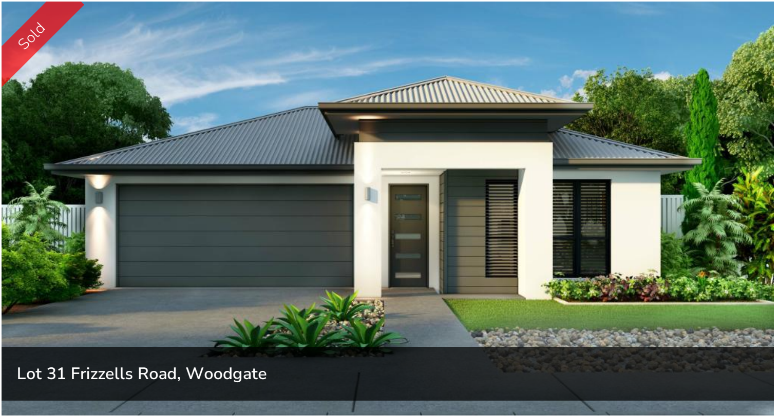
Lot 31 Frizzells Road, Woodgate