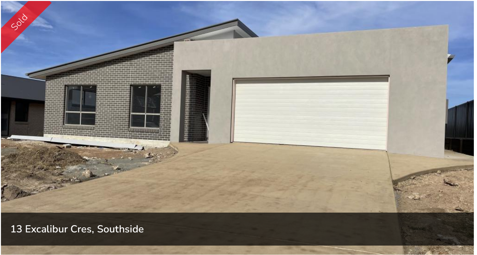
13 Excalibur Cres, Southside