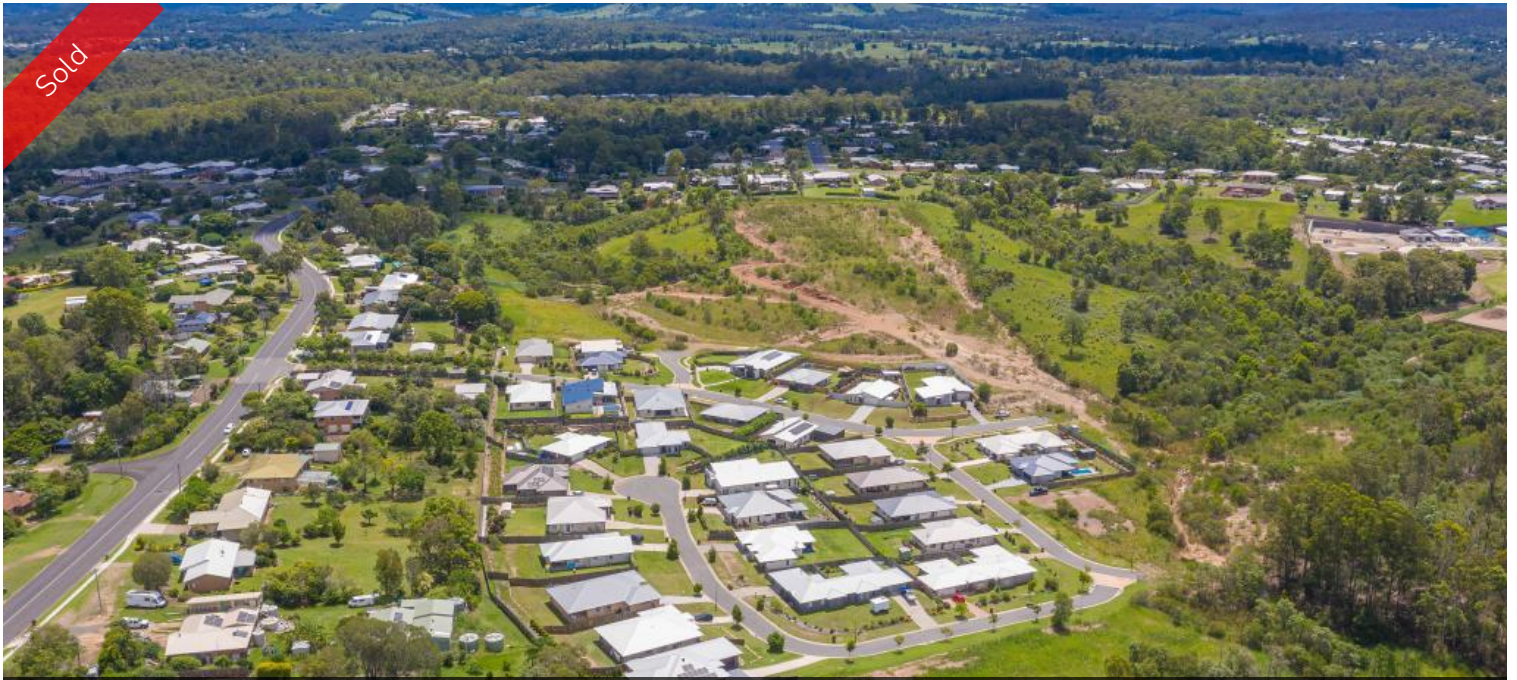
Lot 215 Scotia Place, Southside