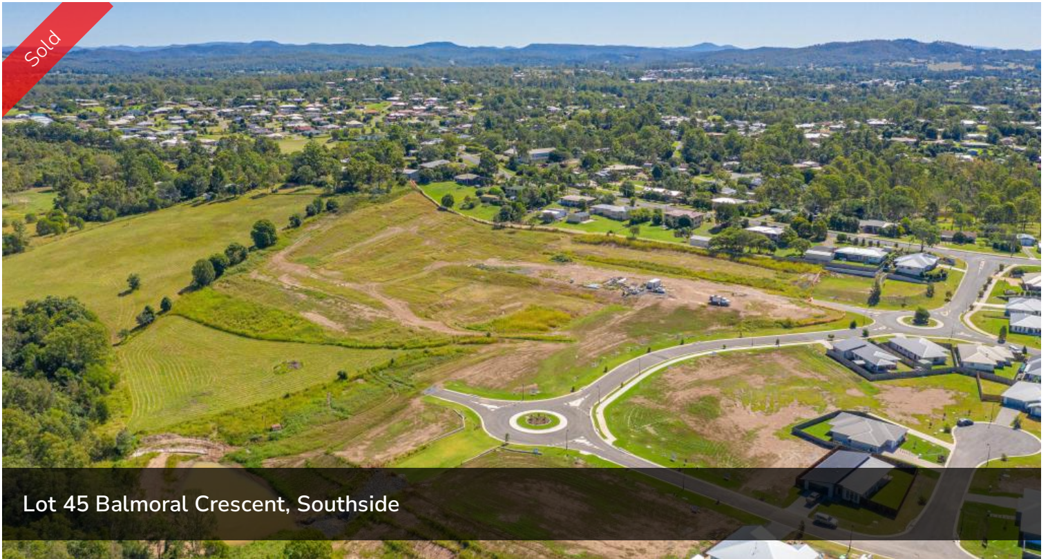
Lot 45 Balmoral Crescent, Southside