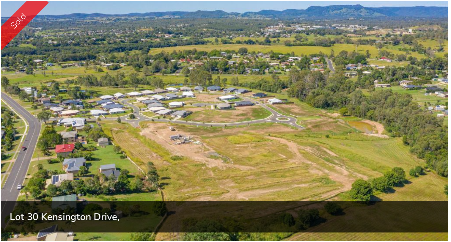
Lot 30 Kensington Drive,