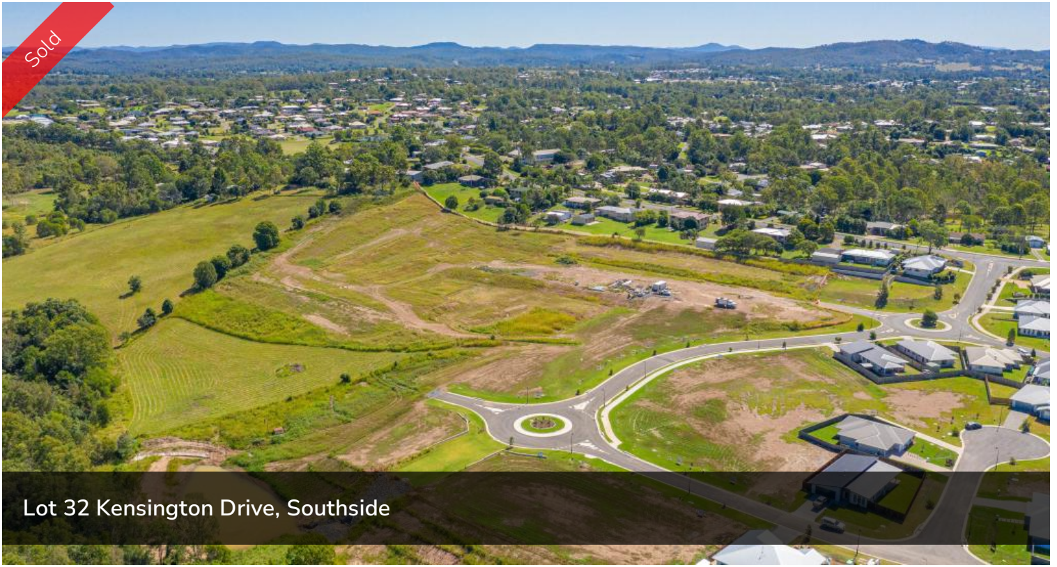
Lot 32 Kensington Drive, Southside