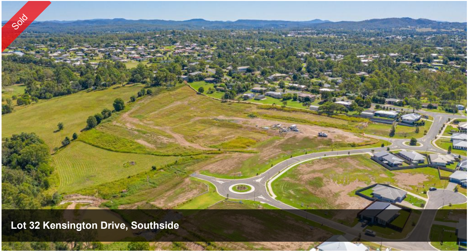
Lot 32 Kensington Drive, Southside