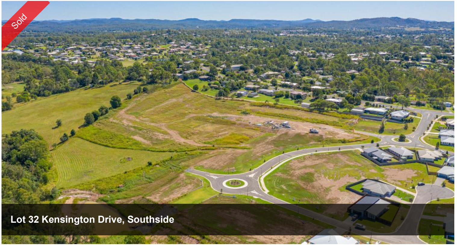
Lot 32 Kensington Drive, Southside