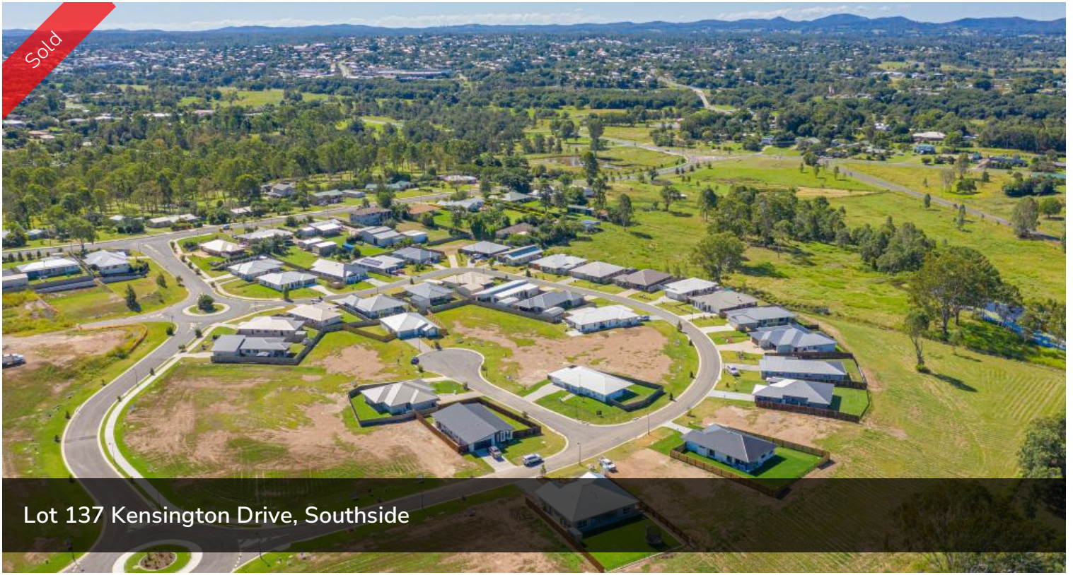
Lot 137 Kensington Drive, Southside