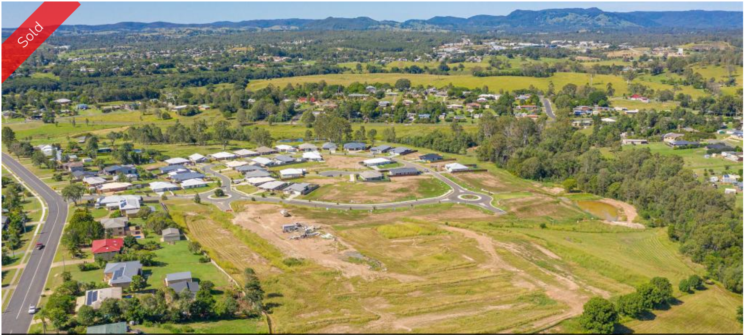
Lot 134 Balmoral Crescent, Southside