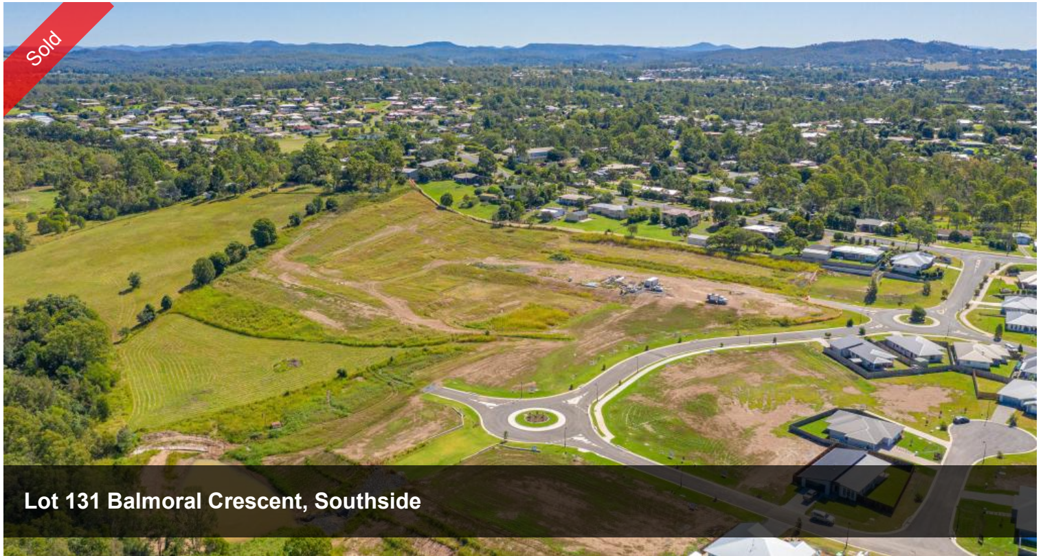
Lot 131 Balmoral Crescent, Southside