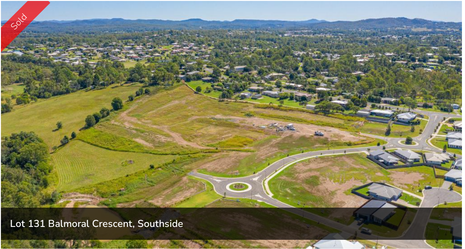
Lot 131 Balmoral Crescent, Southside