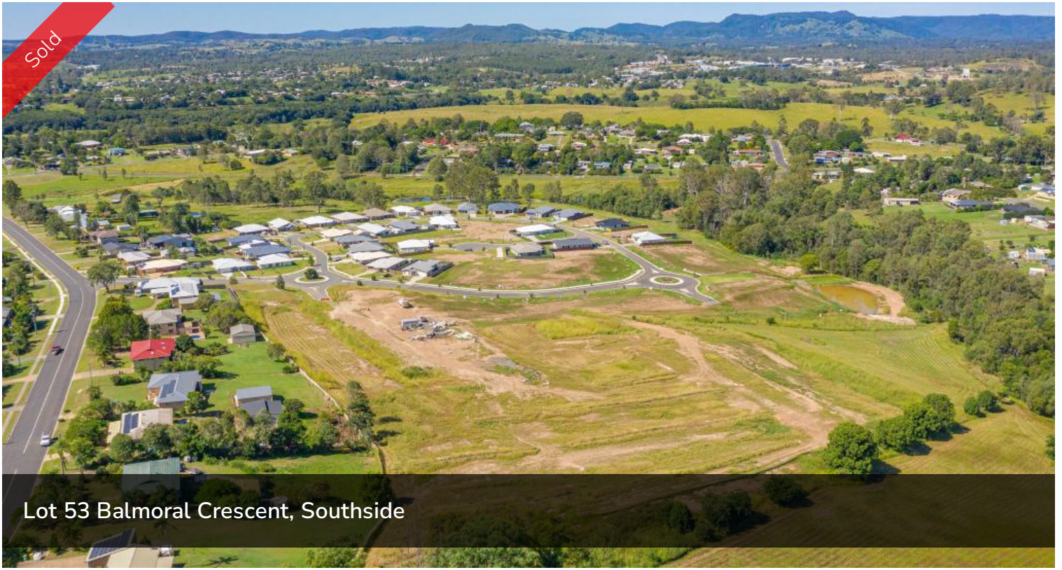
Lot 53 Balmoral Crescent, Southside